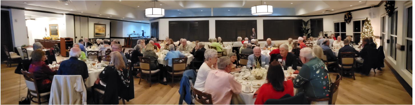
Sixty-Seven members and guests as shown below assembled at The Plantation for holiday festivities.