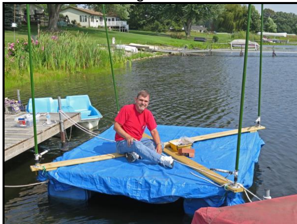
Here's KC9UR setting up the 20M Floating 4-Square swim-raft-mounted antenna

This year these worthy "phaseshifters" set up two stations on Stan's pontoon boat on Round Lake in northeast Indiana, and operated two evenings and two days from Monday, 24 August, through Wednesday, 26 August. To encourage participation, they offered a custom QSL card plus a custom certificate (Stan's handiwork) to everyone who worked them on 3 or more bands. The tactic worked, because this year a record 18 operators became certified "APE Hunters", with 8 working them on 3 bands, 7 working them on 4 bands, 1 working them on 5 bands, and 2 working them on 6 bands!