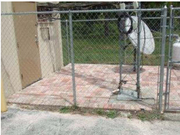
Here's the professional paving job done at the W4AC Repeater site. Looks Great!!