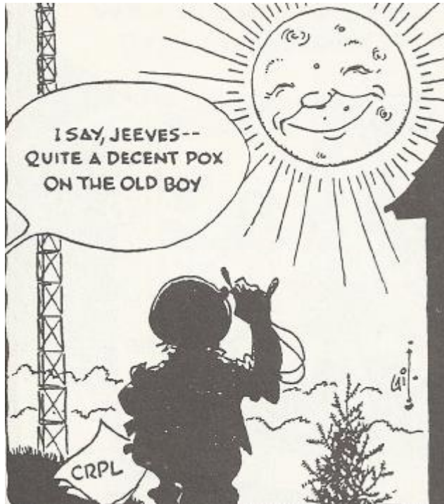
Gil – September 1955

Some 33 months after it started, Cycle 24 is finally starting to act like a true sunspot cycle. The sunspot number hit 173 on 16 September