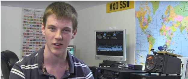
One of the young UK hams in the video

The Radio Society of Great Britain (RSGB) has addressed this line of thinking with a very great video which you can look at via https://www.youtube.com/watch?v=8x6x_6mDVIQ . The video mentions the usual things: learning about technology, learning about people in other parts of the world, disaster communications, hidden transmitter hunts, etc.