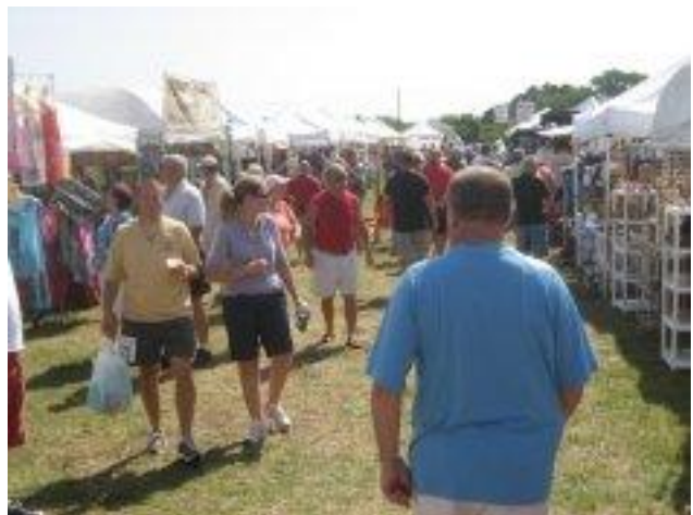
Quite a nice turnout of visitors to the Sharks Tooth Festival.