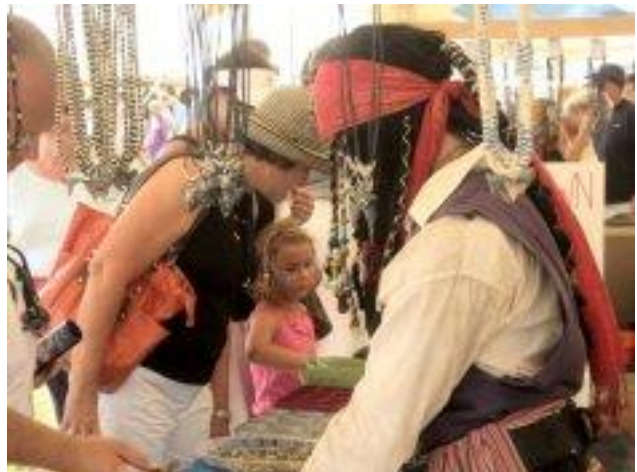
Hold on a minute! Is this really Johnnie Depp from "Pirates of the Caribbean"?

We must always have old memories and young ideas. – Chinese Fortune Cookie