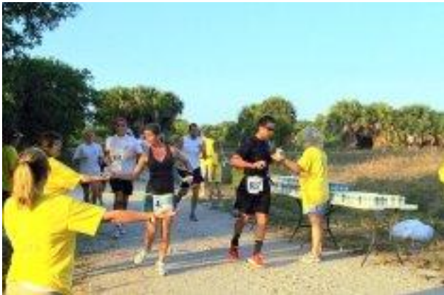
A group of runners and the Festival mascot get water two-thirds through the run.