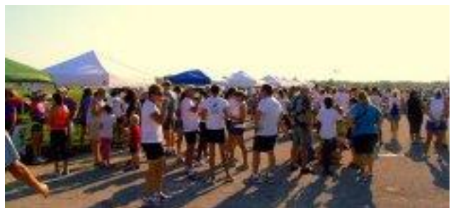
Some of the ± 600 runners mingle near the Start/Finish post after the race. There were no incidents during the race.