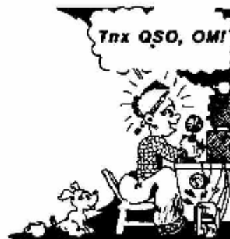
"That's All Folks!"

(From Space Weather News, 16 February 2009)