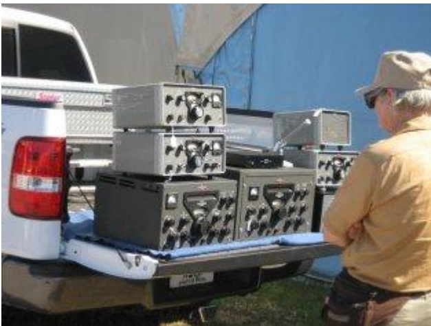
No matter the vintage, Collins equipment just has a classic look, and they worked every bit as great as they looked.