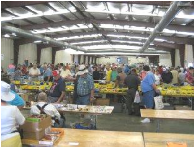
Bob Marchese-K1NOK shot this view of the indoor flea market. Looks like a lot of interest at the far tables.