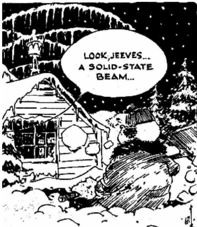
"Gil" Gildersleeve, QST, January 1965