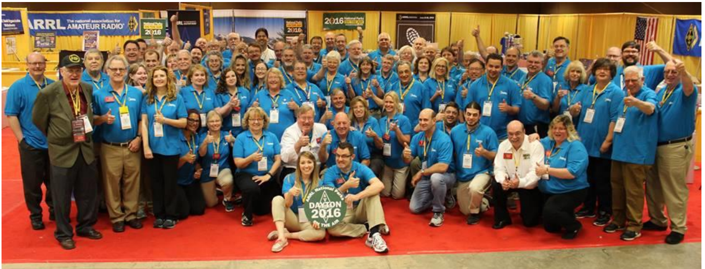
Was anyone left behind to mind the store in Newington?