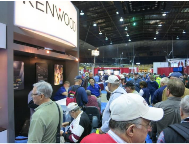
The inside displays were crowded as usual.