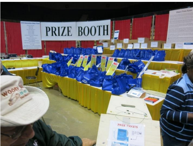
Many great prizes awaiting the lucky winners.