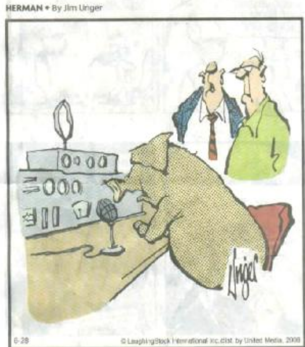
"You never heard of a ham operator before?"