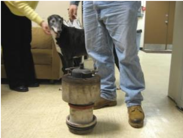
Eimac 4CX35000 tetrode tube, weighs 50# and costs about $4300. Used at AM station WBZ which has signal over 38 states.