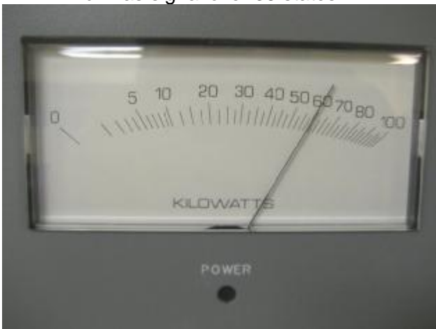
60,000 kw carrier output. From a Mid-November WBZ station tour by Bob Marchese-K1NOK.