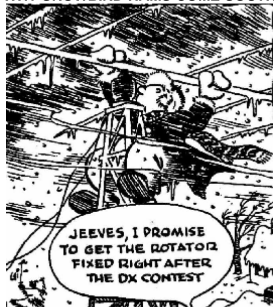
("Gil" Gildersleeve, QST, March 1955)