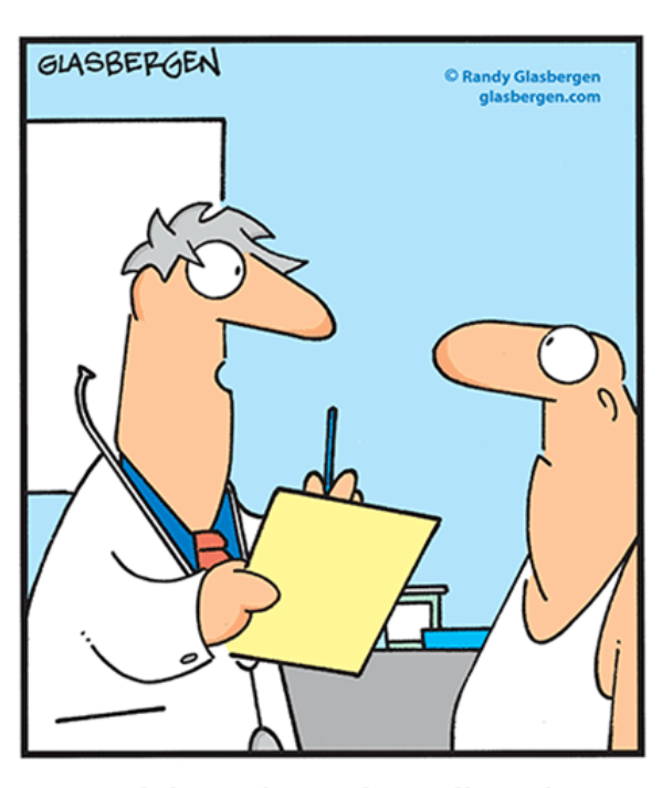
"Keep Christmas in your heart all year long. It will leave less room for cholesterol."