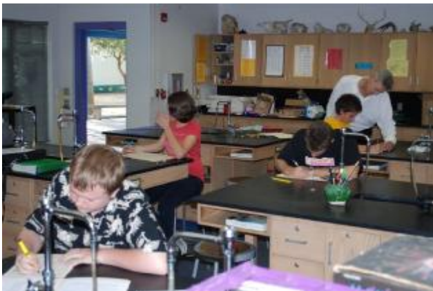
Four of the six examinees filling out the paper work.