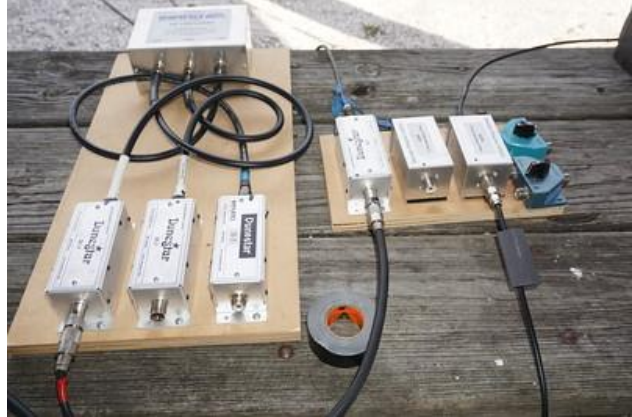
An INRAD triplexer allows the three radios to run all three bands simultaneously to the TA-33.

Here's the tower and tri-bander up and in service. A G5RV was used for 40 and 80 meters.