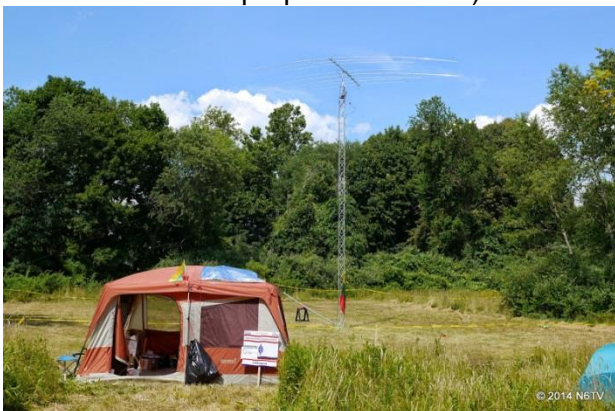
A view of WRTC Site 14D where LY9A and LY4L operated as W1A.

Here's a fine example of the classic "falling derrick" procedure for raising a tower and beam. The tower is 40' of Rohn 25 with a 2X Arrays TX38 tri-band yagi on top. A \pm 20' length of pipe, i.e., the "derrick", has been attached to the hinged base of the tower. After assembly and mounting of the rotator and beam on the tower, at ground level, supported at the top end by a step ladder, stabilizing guys and the raising cable are attached to the tower. A winch or vehicle is connected via cable to the top of the "falling derrick" and the derrick is slowly pulled down to the ground as the derrick pulls up the tower. This was the method used to erect all of the 59 team stations for the international 2014 WRTC competition held 12-13 July up in the Boston area.