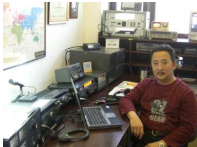
Naranbattar is active on 14.245. Look for him!