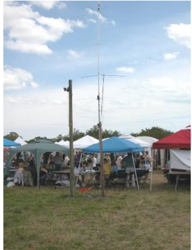
The "antenna farm" at K4S—the venerable Cushcraft R5 and a BudiPole dipole.