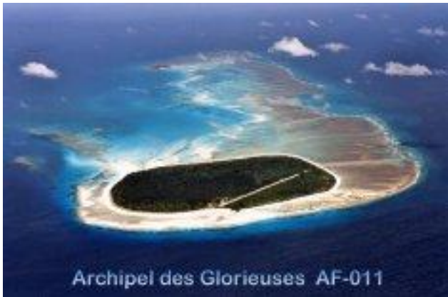
Archipel des Glorieuses AF-011

The Glorioso Islands that will be activated 09 – 28 July by a team of French military hams. If you're into DXing, this is the BIG ONE!