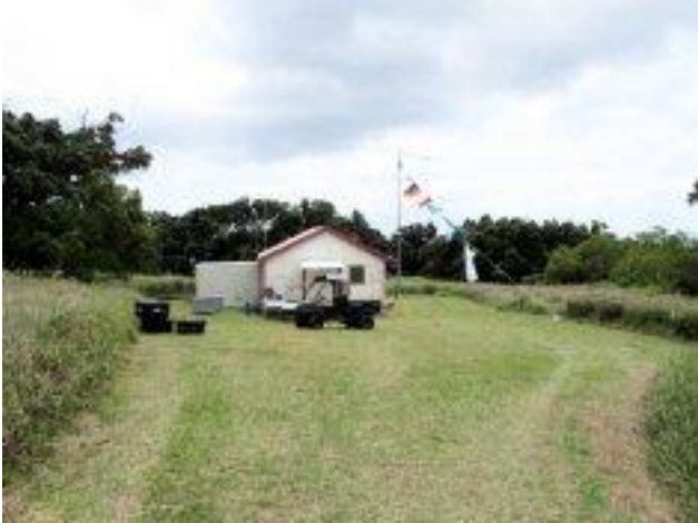
The Base Camp on Raoul Island.

On 19 November the anticipated, international team operation came on the air from Raoul Island. The operation was well received by local DXers.